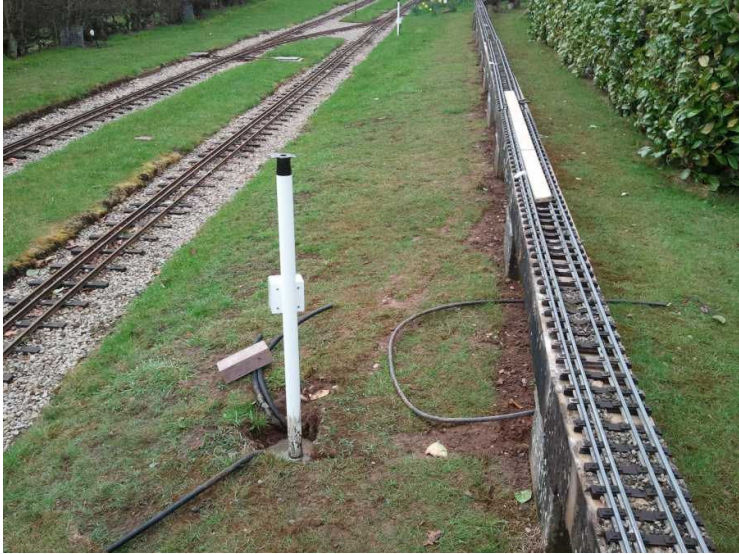
New signals appear in position around the refurbished high level track