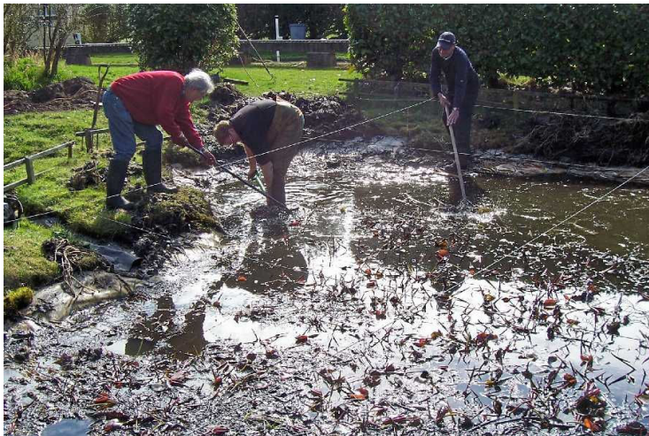
Work on renovating the pond continues at a rapid pace