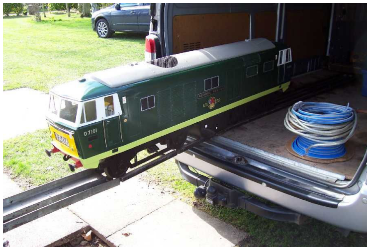
The Hymek returns after a superb restoration by Garry Tyso